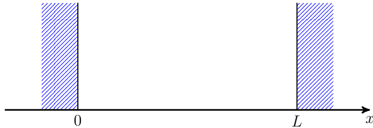
Figure 1: Geometry for the one dimensional Casimir calculation: two perfectly conducting plates separated by a distance L .

Consider two perfectly conducting plates separated by a distance L , as illustrated in Fig. 1.